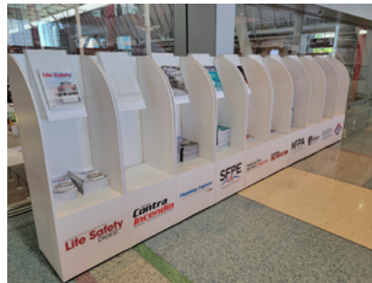
Publication bins at the recent NFPA show. Life Safety Digest is right at the front of the pack!