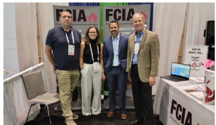
FCIA Marketing Committee members volunteer at the FCIA booth at ASHE.