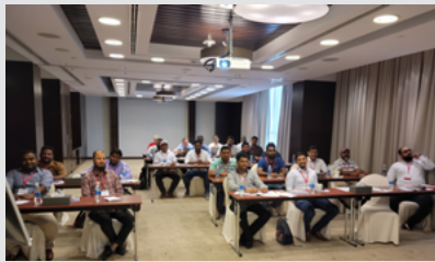
Doha attendees prepare to take the FM & UL Firestop Exams.