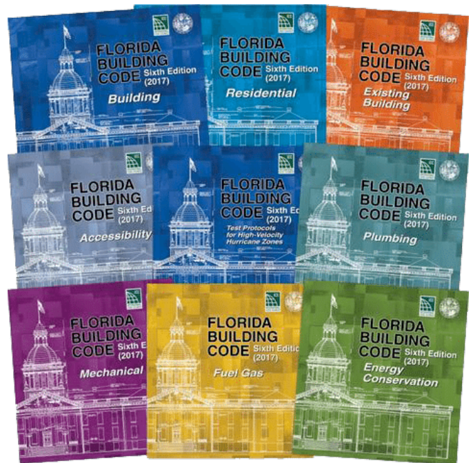
The sixth edition Florida Building Code. Be sure to get the current version, the seventh edition (2020).

Even though we weren't successful this time around in getting Firestop Special Inspection and FM/UL Contractors into the FL Building Code, we do continue see 07-84-00 Specifications within Florida, some of which are held for both FM 4991 or UL Qualified Firestop Contractors and Firestop Special Inspection in accordance with ASTM E2174 and/or ASTM E2393. We'll keep trying to get these added into the FL Building Code though. Look for more development on this during the next code development cycle.